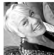
Music, Dances & Parties page 4