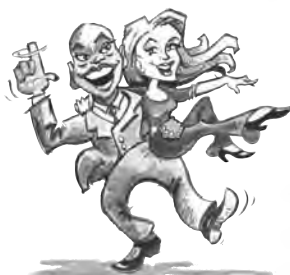
Classes & Workshops pages 2 & 3